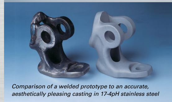
Comparison of a welded prototype to an accurate, aesthetically pleasing casting in 17-4pH stainless steel